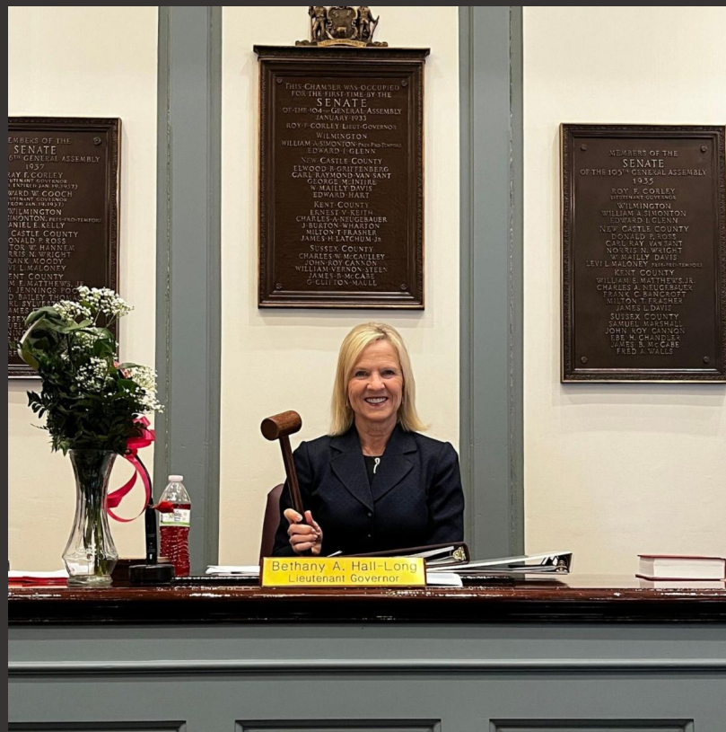
Lt. Governor Hall-Long presiding over the first day of session during the 152nd General Assembly in Legislative Hall